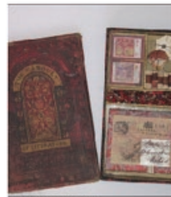
red letters peter hudson (usa)