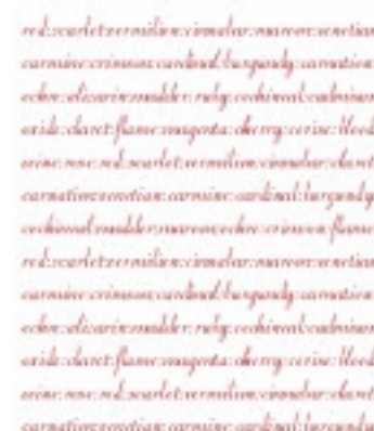
red arisa moss (usa)