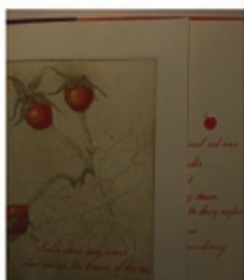
i know a little garden alison acheson (usa)