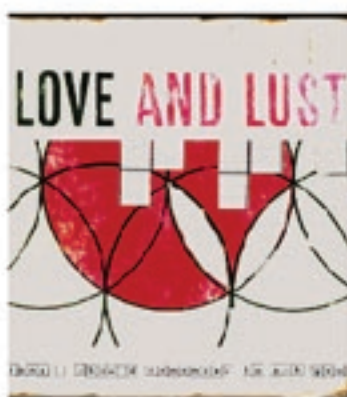
love and lust: questions i should remember to ask you quana lane (usa)