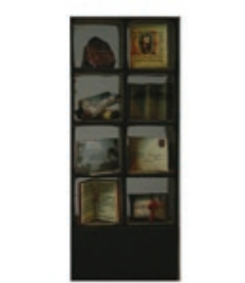
red letter day alex underland (usa)