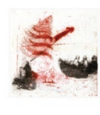
navigation of a scent deborah bach smoller (usa)