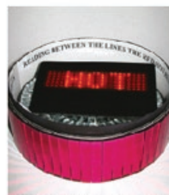
read between the lines anne marie power (usa)