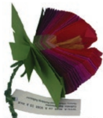
a rose is a rose is a book mary newson (usa)