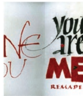
you are ME rhonda davis (usa)