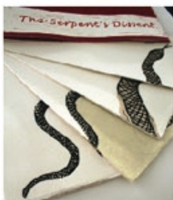
the serpent's dissent anne bossett (usa)