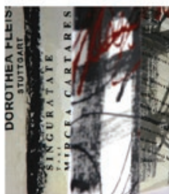
loneliness dorothea fleiss (germany)