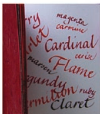
ready to be red arisa moss (usa)