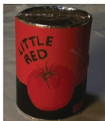
little red valia quirk (usa)