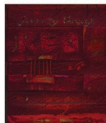
journey through red vella parkison (usa)

red/read artist book exhibition 10.08.2006 - 02.09.2006