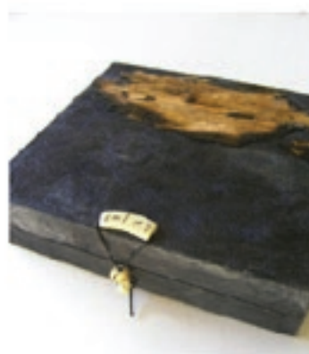
storybook-chambers gorge frances victory (usa)