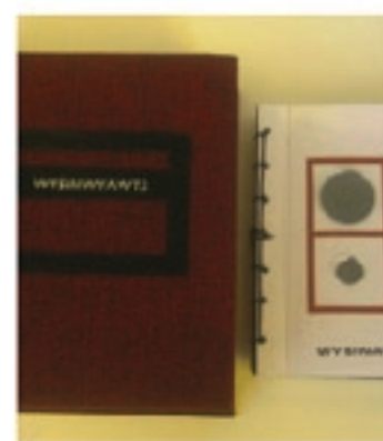
wysniyawn laraine brock (usa)